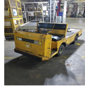
Hot Metal Truck (HMT)