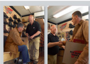
Staffed by Red Wing certified fit specialists who will select the right product and the right fit, right on the spot.

The Shoemobile will be loaded with a customized inventory of work shoes and boots specifically designed for your particular working environment to meet all your safety footwear needs.