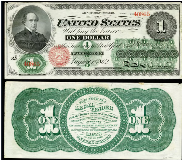
Image of the first US one dollar bill (United States Note) issued in 1862

1786 US Congress unanimously chooses the dollar as the monetary unit for the United States of America