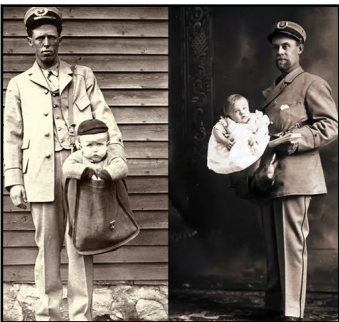
Children "mailed" by their parents because it was cheaper to mail them - if a child came in under the 50 pound parcel weight limit, than other ways to travel