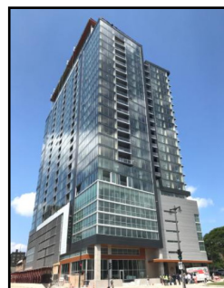
2022 Ascent skyscraper in Milwaukee certified as the world's tallest timber building at 25 stories, 86.6 metres (284 feet)