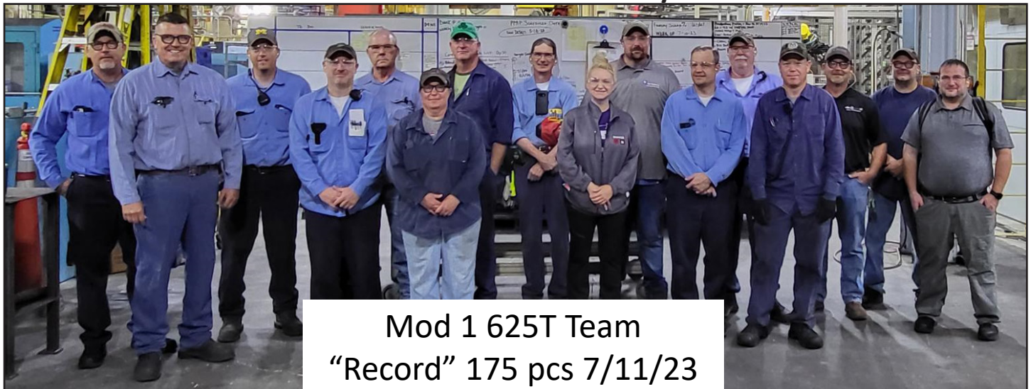
Mod 1 625T Team "Record" 175 pcs 7/11/23